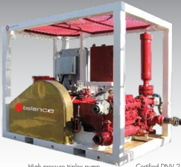
High pressure triplex pump

Certified DNV 2.7-1/T3, Zone II, ATEX-certified, built in a DNV crash frame